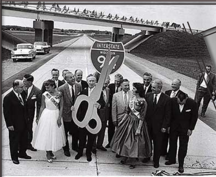
Ribbon-cutting ceremony along the first portion of Interstate highway to be completed in Wisconsin on September 4, 1958–1-94 in the Waukesha area.